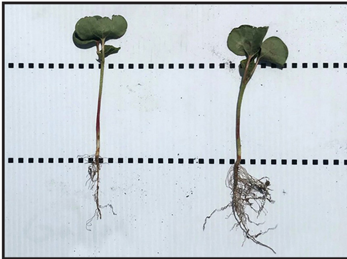
GSP 2 gal Levitate + 4 oz Radiate